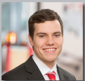
Benedikt Csauth Development & Design